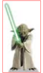
Buy life size Yoda!